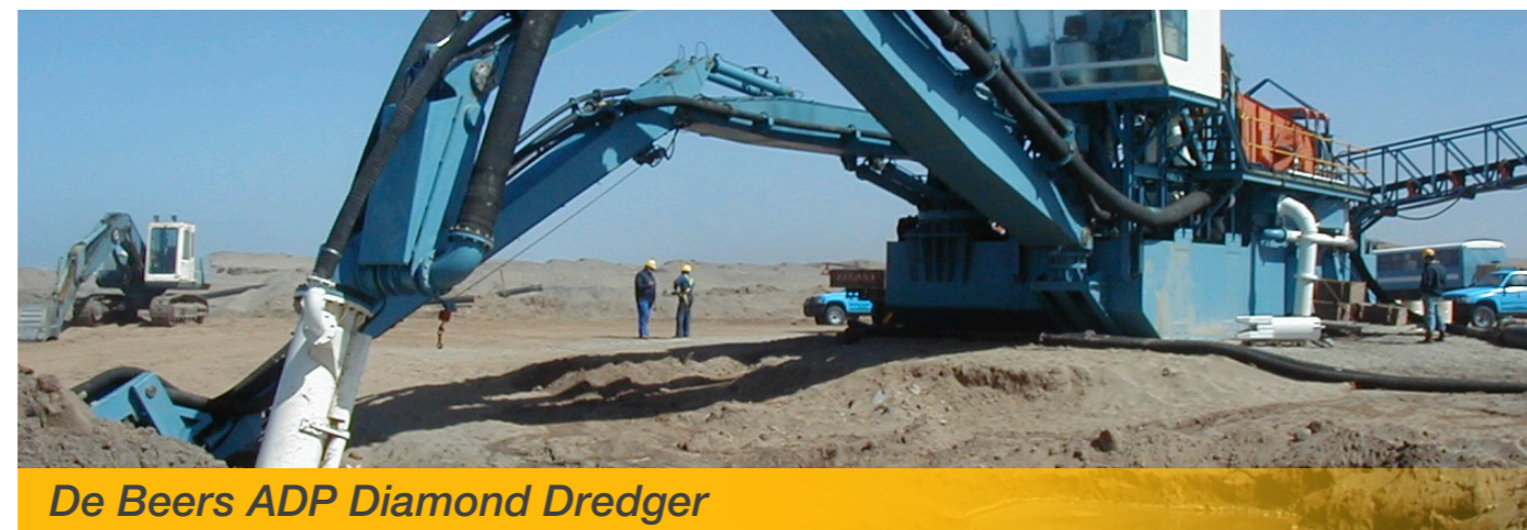
De Beers ADP Diamond Dredger

“The infusion of an entrepreneurial culture into the organisation has been key over the past 10 years, as it’s led us to being quite a significant player in the rail space.”