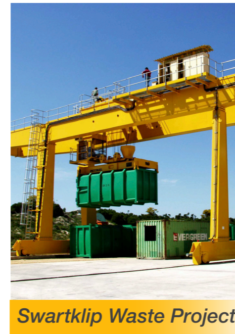
Swartklip Waste Project