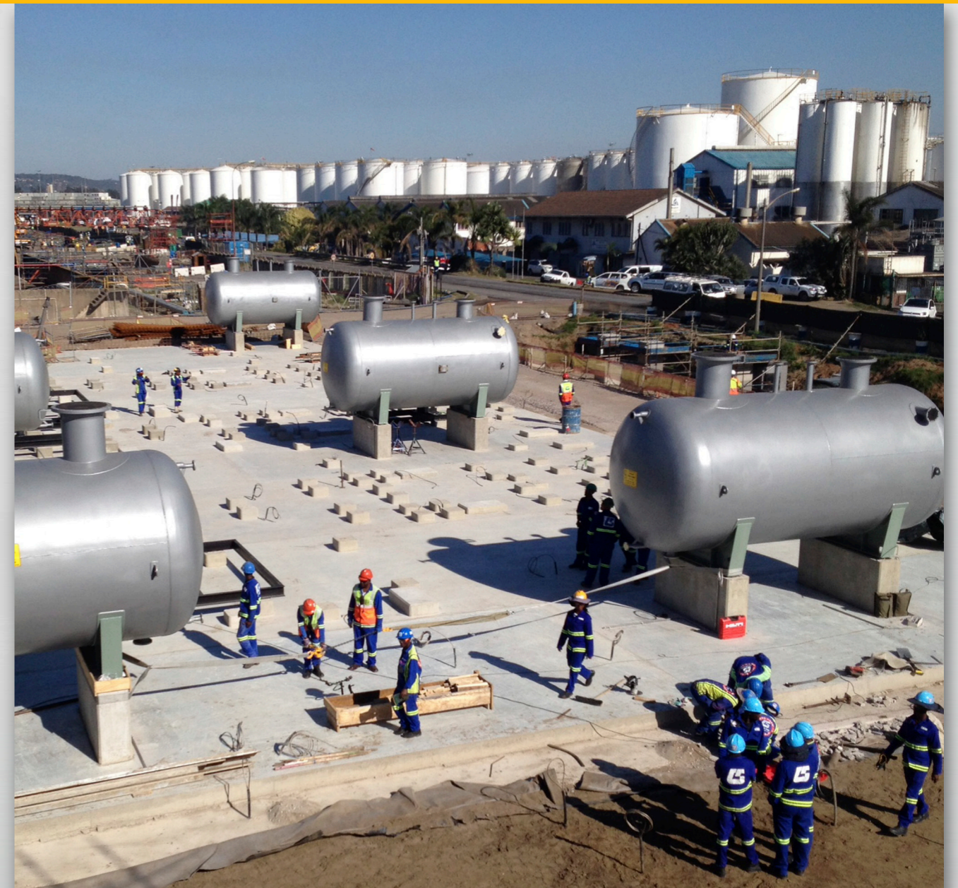
Multi-Products Pipeline comprises of a pipeline that stretches between a coastal terminal located at Island View in Durban and the Inland Terminal located at Jameson Park near Heidelberg.

"The infusion of an entrepreneurial culture into the organisation has been key over the past 10 years. For example about three years ago an opportunity presented itself, for which we positioned ourselves and are now a potentially meaningful player in the rail space."